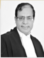
Hon'ble Mr. Justice Arjan Kumar Sikri Supreme Court

Born on 7th March, 1954. had excellent academic record. Stood third in the merit list in Higher Secondary from CBSE, Delhi. Did his B.Com(Hons.) from Shriram College of Commerce, Delhi University in the year 1974 and LL.B from Law Faculty, Delhi University in the year 1977. Awarded Gold Medal for attaining first position in LL.B. Awarded special prize for getting highest marks in Constitutional Law I & II. Had distinction of securing first position in all six semesters of LL.B and getting all possible prizes and medals of Delhi University for LL.B course. Did his LL.M from Delhi University and got first position in three years course. Won medals and prizes in various extra curricular activities. Was president of Campus Law Centre, Delhi University in 1976-77. Was member of Academic Council of Delhi University in the year 1976-77 and various committees of Delhi University. During his schooling from 9th standard onwards till LL.M., he was given scholarships each year.